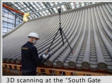
3D scanning at the "South Gate Gokuden-in" (Nara Pref.)

"South Gate of the Gokuden-in" (Ministry of Land, Infrastructure, Transport and Tourism