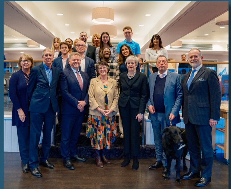
University of Reading (Business Alliance member) with panel members of the TVCC Parliamentary Question Time, Nov 2023

Working together through the TVA, the Chamber seeks to promote the contribution of our members to the economy and co-develop solutions with civic leaders to address the challenges and develop strategic priorities for our region and the wider economy. This culminates in bespoke events and projects to tackle the issues of the time. Throughout 2023 and 2024 the focus has been to develop closer links between businesses and parliamentarians.