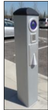
Park and Power